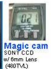
Magic cam SONY CCD w/ 6mm Lens (480TVL)