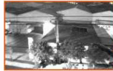
Normal cam SONY CCD w/ 6mm Lens (420TVL)

Magic Camera shows clear color picture while Normal Camera has turned black and white.