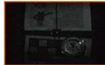
Normal cam SONY CCD w/ 6mm Lens (420TVL)

Magic Camera maintains an outstanding performance of clear color picture while Normal Camera has already lost a lot of visibility.