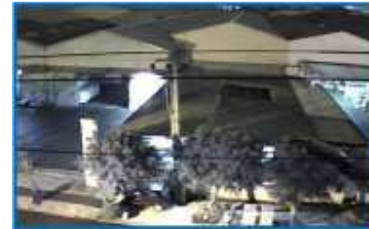
Magic cam SONY CCD w/ 6mm Lens (480TVL)